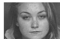
Nine arrested in