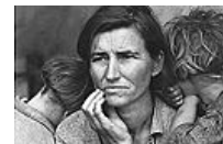
'Warren Buffett Indicator' Signals Co... Moneynews