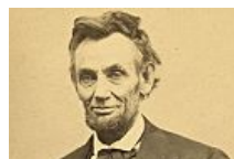
You Won't Believe Who's Related to Abr... Ancestry.com