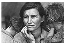
'Warren Buffett Indicator' Signals Coll... Moneynews