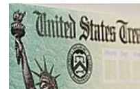
Homeowners Are In For A Big Surprise... Smart Life Weekly