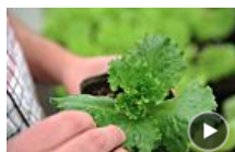
USDA Drought Tolerance Study Feb 20, 2014