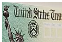
Homeowners Are In For A Big Surprise... Smart Life Weekly