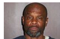
Six arrested in motor-